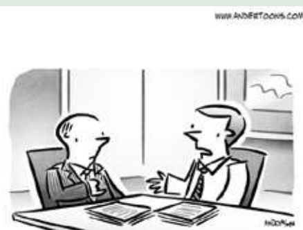
“The contract is signed, so a pinky swear seems like overkill, but if you insist.”