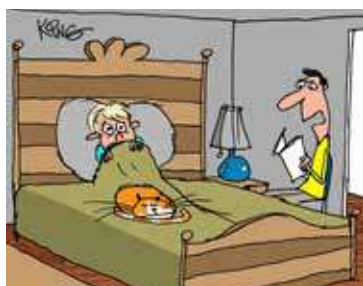
“He opened his e-mail and saw the attachment from an unknown source. His hand slowly reached to click on the paper clip. He had no idea what horror awaited him ...”